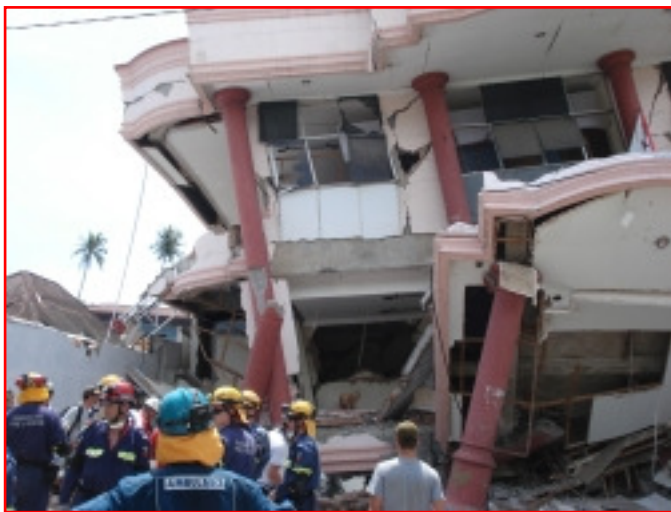
Damage from the Sumatran Earthquake (above)