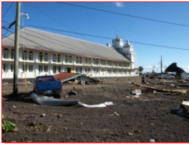
The aftermath of the Tsunami in Samoa in September 2009

There were no visits to Queensland by nuclear powered warships.