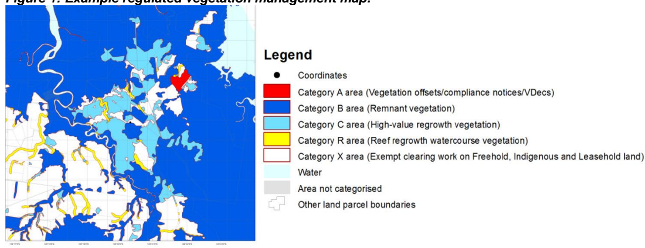
Regulated Vegetation Management Map